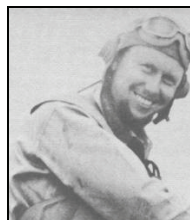
Stanley "Swede" Vejtasa